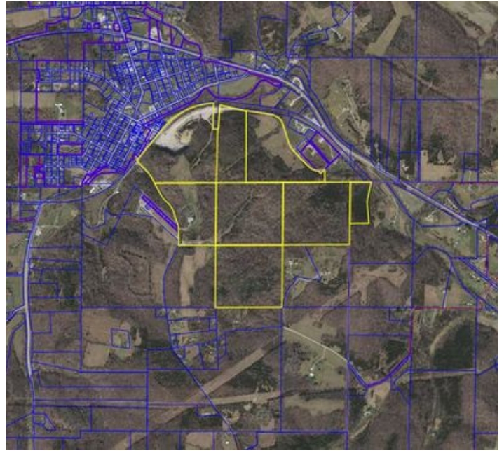
Aerial of warehouse